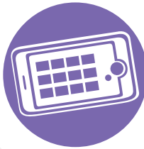
Epson P-6000 multimedia storage viewer

Buy an Epson P-6000™ multimedia storage viewer and receive the following back by mail: