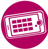
Epson P-6000 or P-7000 multimedia storage viewer

Buy an Epson P-6000™ or P-7000™ multimedia storage viewer and receive the following back by mail: