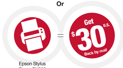
Epson Stylus Photo RX595

PRODUCTS MUST BE PURCHASED BETWEEN 11/18/07 AND 1/12/08.