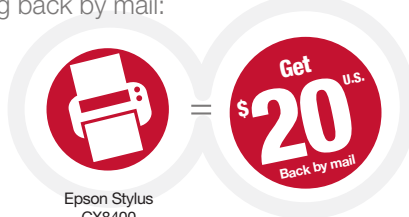
Epson Stylus CX8400